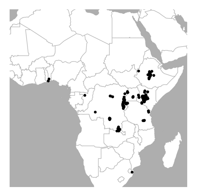
Figure 1. Geographical distribution of plot observations (black dots) stored in SWEA-Dataveg.

All plots included in the database are geo-referenced. A logical variable called "validation_coordinates" indicates whether these coordinates were provided by the authors as coordinate values or in a detailed map ("true"), or if they are inferred from the description of locality ("false"). Observations have been undertaken in 12 countries with 2,804 plots (51%) sampled in Kenya, 986 (18%) in the Democratic Republic of the Congo, 467 (8%) in Ethiopia, and 425 (8%) in Tanzania. The rest of the plots were collected in Uganda, Togo, Rwanda, South Africa, Burundi, Congo-Brazzaville, Benin, and Zambia (see Figure 1).